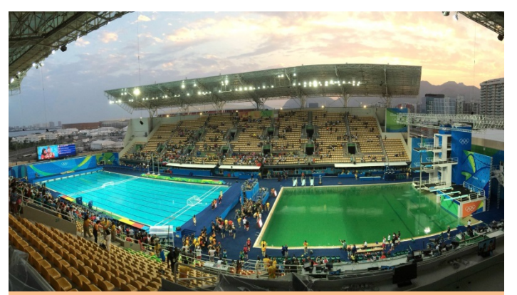
The diving well at the Rio 2016 Olympic Games turning greener by the day.

Many areas are experiencing large algal blooms including Florida, Chile, the Great Lakes and New York Central Park. Closer to home, warning signs can be found around Harvey and Washademoak lakes. In Saint John, we are told to not feed the ducks in Rockwood Park: a well-fed, increasing population of ducks means increasing levels of faeces, which will release, into the water, higher levels of phosphorus and nitrogen, prime nutrients/fertilizers for algae to bloom and eventually choke other plants and animals, when they are deprived of oxygen consumed by the decaying bloom.