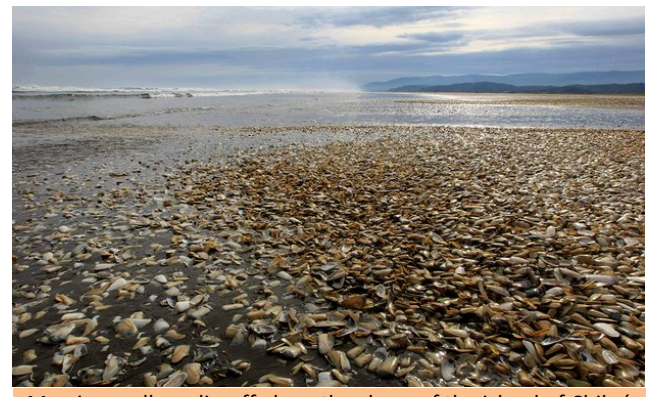
Massive mollusc die-off along the shore of the island of Chiloé.

to process the rest on land, the Chilean Navy and fisheries managers authorized its dumping at sea, about 130 kilometers off the island of Chiloé. A second algal bloom followed a few weeks later, this time of the toxic dinoflagellate Alexandrium catenella , and waves of dead sardines, clams, jellyfish, birds and even mammals covered kilometers of shoreline. While the possibility of a link between the decomposing salmon thrown into the sea and the Alexandrium bloom is still being investigated by a government ordered commission (could it be blamed on El Niño and other oceanic conditions?), some non-governmental