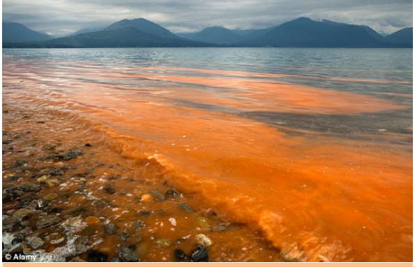
Red tide along the shore.

Are all algal blooms equal? Are they all harmful? Was killing all these salmon necessary after the first algal bloom hit Chile last March?